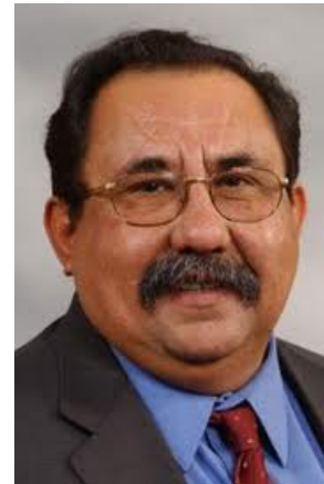
Raúl Grijalva (D-AZ) Ranking Member