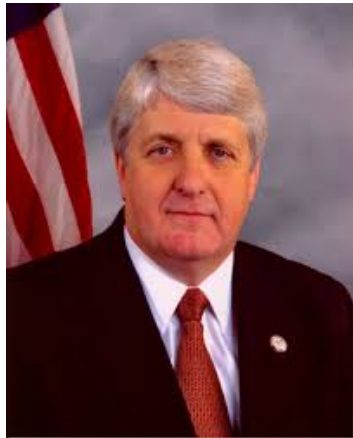
Rob Bishop (R-UT) Chairman

Has primary jurisdiction over legislation related to public lands, natural resources, and Indian affairs