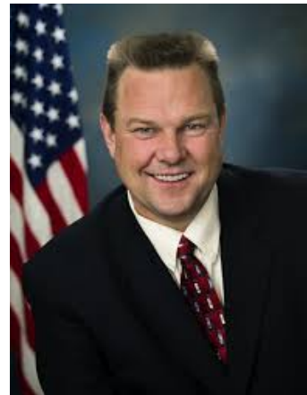
Jon Tester (D-MT) Vice-Chairman