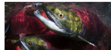
CLIMATE ADAPTATION BARRIERS AND NEEDS EXPERIENCED BY NORTHWEST COASTAL TRIBES Key Findings from Tribal Listening Sessions AUGUST 2024

Calling citizens, staff and Tribal leaders of Oregon and Washington coastal Tribes: Opportunity to provide feedback on draft policy tools developed to help address climate adaptation funding barriers experienced by Northwest coastal Tribes. The climate adaptation funding barriers addressed by these tools were identified in this August 2024 report . These policy tools were produced through a partnership between the Tribal Coastal Resilience Project and the Native American Law Center at the University of Washington School of Law, the Environmental and Energy Law Program at Harvard Law School, and the Environmental Policy Innovation Center. There are three policy tools in total, including: A Funding Opportunities Table, Resources for Flexible Funding Opportunities (638 Agreements and 477 Plans), Information on Tribal Disaster Declarations. You are invited to provide feedback on one, two, or all three policy tools before the products are finalized. Comments are due by May 5th, using this survey . Compensation will be provided for feedback provided by citizens, staff and elected officials of coastal Tribes in Washington and Oregon.