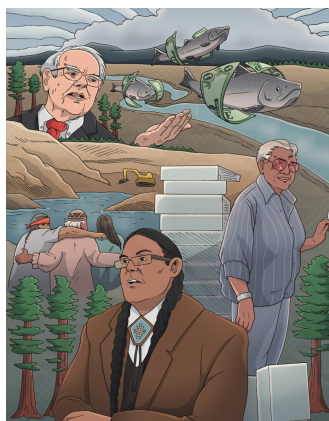
How the Klamath Dams Came Down