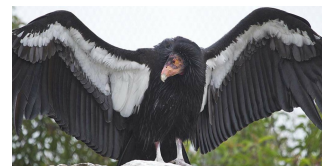
Condors are coming back to the Pac NW