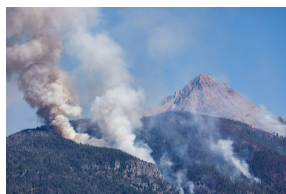
CSKT Climate Change StoryMap Wins Award for Excellence in Traditional Ecological Knowledge