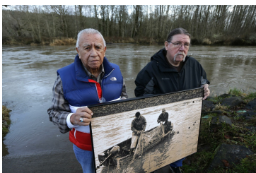
The Boldt Decision's impact on Indigenous