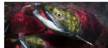
CLIMATE ADAPTATION BARRIERS AND NEEDS EXPERIENCED BY NORTHWEST COASTAL TRIBES Key Findings from Tribal Listening Sessions AUGUST 2024