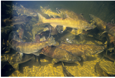
Federal funds boost tribal-led revival efforts for salmon in upper Columbia River Basin